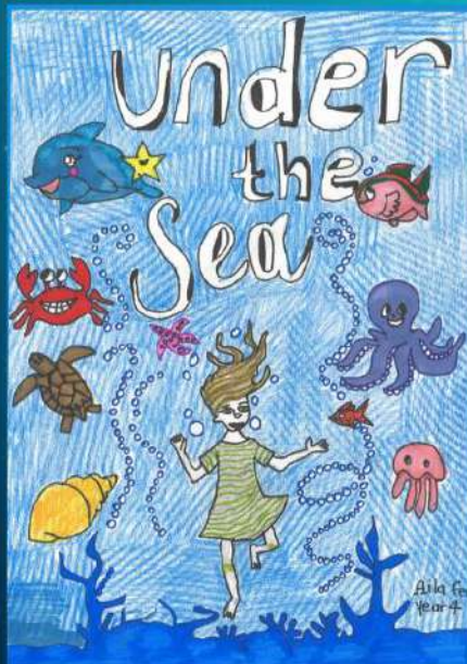
Aila Year 4