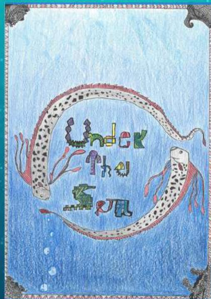
Hiro Year 5